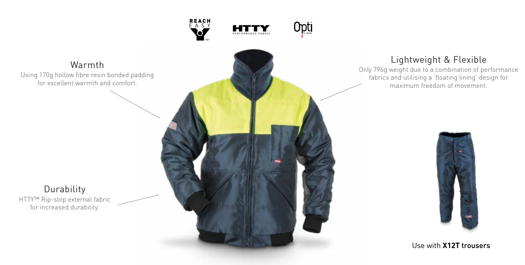
Sizes: XS - 5XL | Order Code: X12J

A strong, lightweight and versatile PPE jacket for cold and sub-zero temperatures