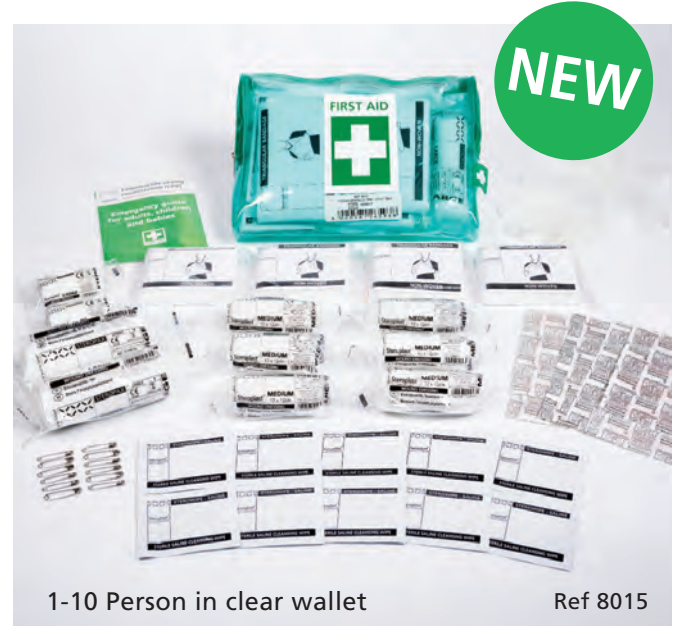
1-10 Person in clear wallet

Use hypoallergenic adhesive and are safe to use on sensitive skin, particularly where children are concerned.