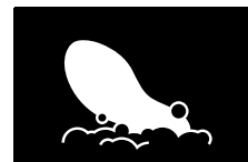
WASHABLE REMOVABLE INSOLES