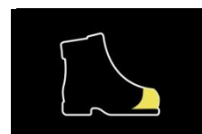
RUBBERIZED TOE PROTECTION