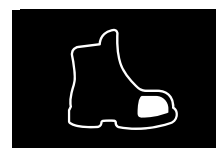
NON METALLIC TOECAP