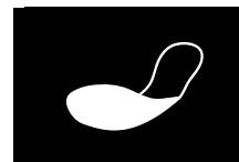
FLEXIBLE ANTI-PUNCTURE INSOLE