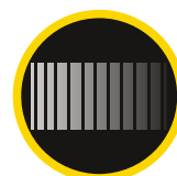
PART ELASTICATED WAIST