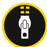
YKK MAIN ZIP LIFETIME WARRANTY