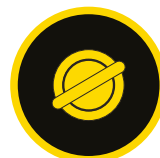
NON-SCRATCH HEAVY DUTY FIXING STUDS