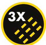
TRIPLE STITCHED SEAMS