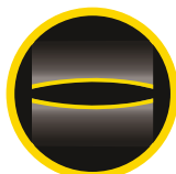
INTERNAL KNEEPAD POCKET