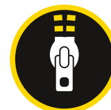
BRASS YKK ZIP LIFETIME WARRANTY